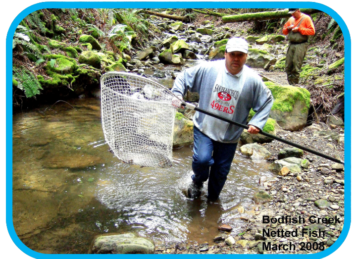
Bodfish Creek Netted Fish March 2008